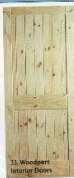
33. Woodport Interior Doors