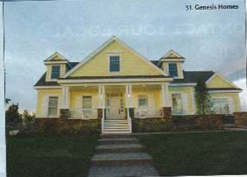
31. Genesis Homes