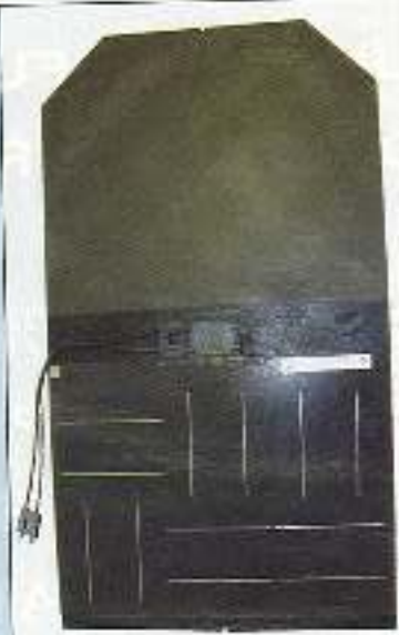
35. Atlantis Energy Systems